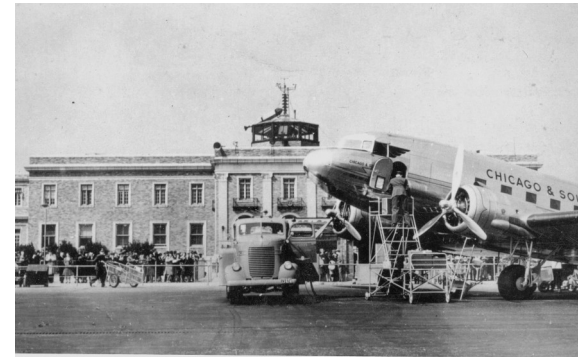
The photograph is of a Chicago & Southern DC-3 at the original St. Louis Lambert Field terminal.

The original terminal was dedicated in April 1933. The two story building was described as "A Union Station Of The Air." It was initially criticized as being too large as it could handle four plains at one time. The terminal stood on Lindbergh Boulevard at the northwest corner of the airfield. It was in daily use until a new terminal on the south side of the field was opened in 1956.